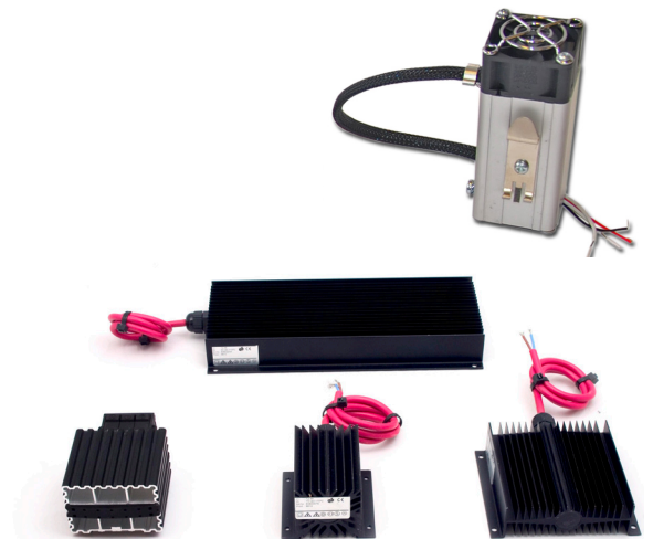
Example of product design