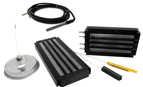
Example of product design